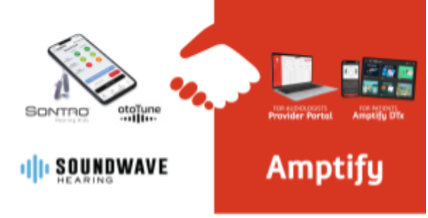
Self-Fit Hearing Aids with Virtual and In-Person Support

OAK BROOK, IL, and ST LOUIS, MO, SEP. 28, 2022 – Today, Soundwave Hearing, a pioneering OTC hearing aid manufacturer, announced it has teamed with Amptify, a leading hearing health technology platform, to bundle the purchase of the customizable Sontro Hearing Aids with access to Amptify's provider network and a personalized version of Amptify's digital therapeutic (DTx) for hearing loss.